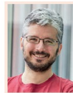
Francis Crick Institute London (UK)

Activation of an origin of DNA replication visualised by cryo-EM