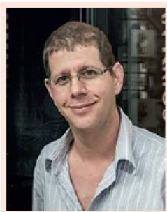
University of Zurich (Switzerland)

From cell adhesion to the nuclear envelope: a journey of cryo-ET